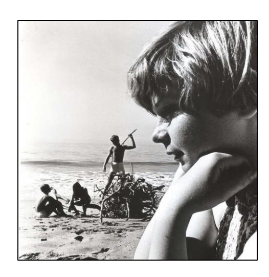
"It isn't Lord of the Flies exactly, but the characters seem to exist in a similar hermetic bubble"

As a longtime admirer of Last Summer, I'm absolutely thrilled to be presenting this special